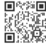
Virginia Western Application